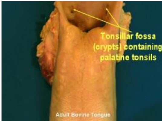
Photo demonstrating the location of the palatine fossa (crypts) which contain the palatine tonsils.

These tonsils are SRM and are to be removed.