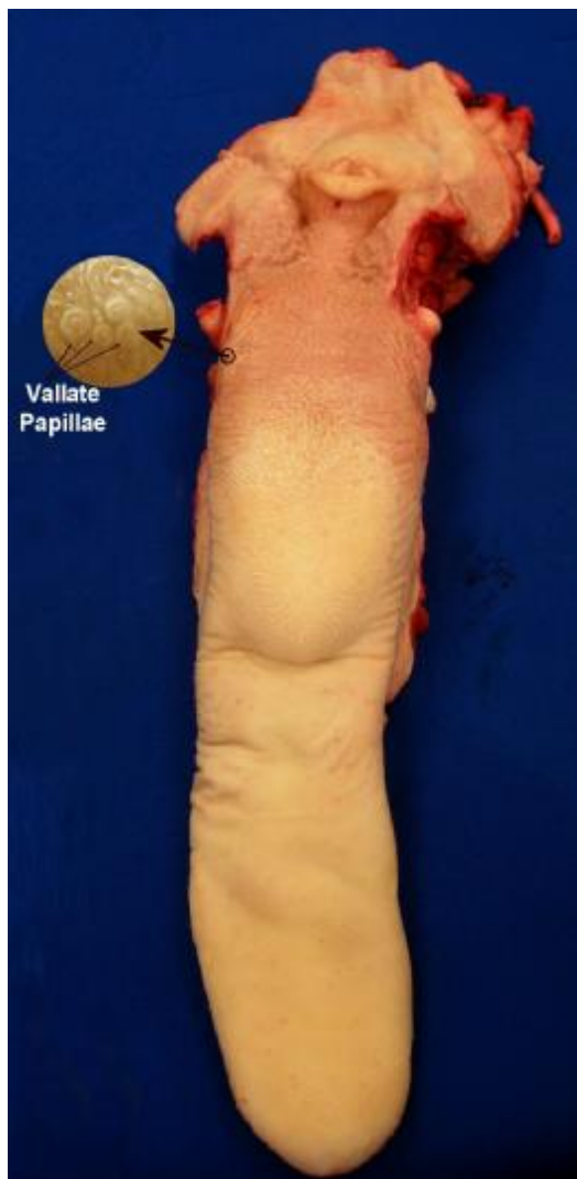
Photo identifying the vallate papillae.

These tonsils are SRM and are to be removed.